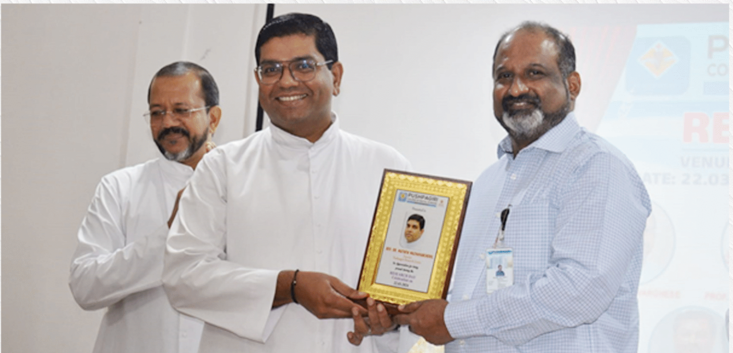
Research Awards for faculties and students were distributed during function