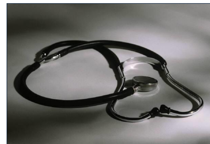
Figure 1. Label in 24pt Calibri.

Speaking of Results, yours will look better if you remember to run a spell-check on your poster! After you've added your content click on Review, Spelling , or press F7.